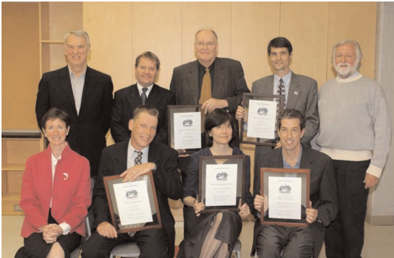
Above Photo, from left to right:

The twenty-one residents associations that make up FONTRA believe that Ontario and Toronto can and should achieve better development. Its central issue is not whether Toronto will grow, but how. FONTRA believes that sustainable urban regions are characterized by environmental balance, fiscal viability, infrastructure investment and social renewal.